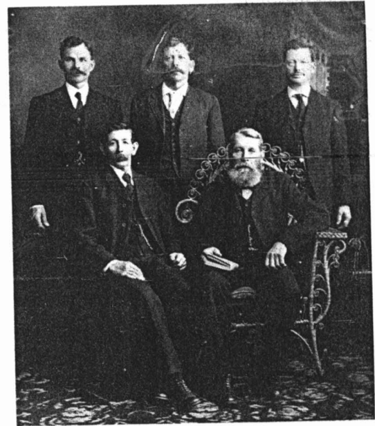
The "Five Archies" (McGee)