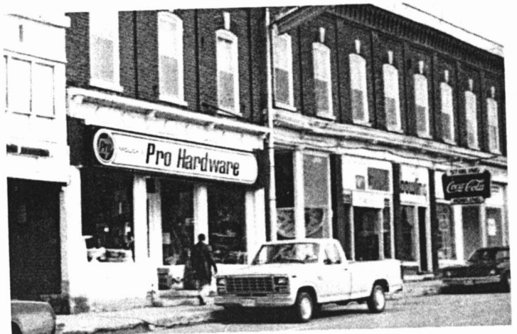
Mouck's Pro Hardware

wishes, we have enjoyed the friendship of residents of this village and surrounding area. We are very grateful for your patronage and hope we warrant the trust you have put in us. THANK YOU.